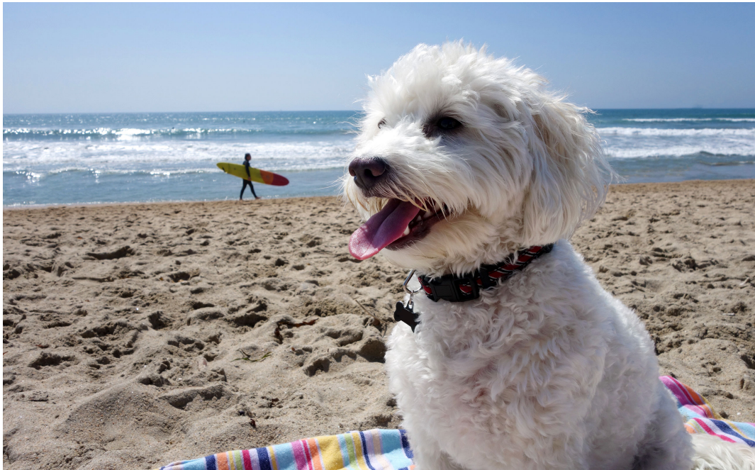
Max at the beach :)

Caring for Pets with Love & Kindness Since 1977